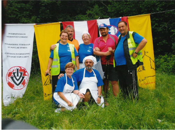
Our first meeting at 2006.