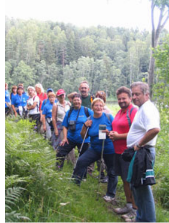
Friends in walk at Oteppa. A walk at South Estonia national park.