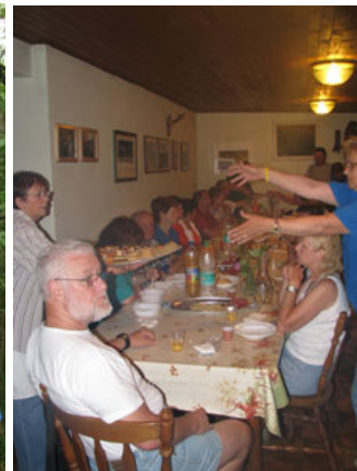
A social meeting at at Hunter's house.