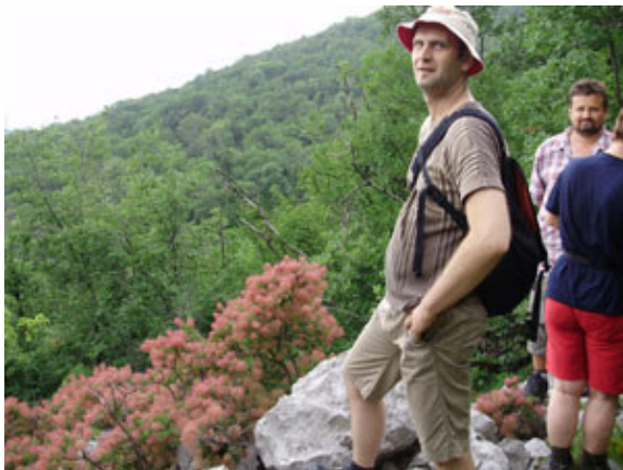
A stop for an interesting sightseeing.