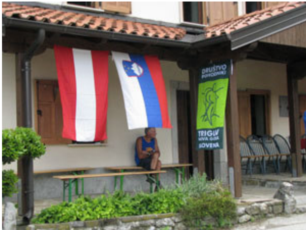
Flags (Austrian, Slovenian and of club Društvo pohodniki triglav Nova Gorica) on the Hunter house are waiting for walkers : Austrian and Slovenian.