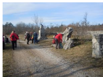
Pri Borojevičevem stolu