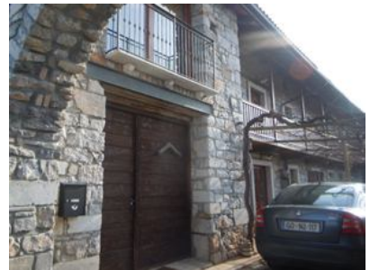
Kostanjevica na Krasu